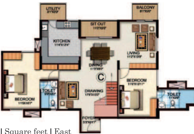
2218 | Square feet | East